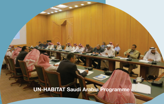
UN-HABITAT Saudi Arabia Programme

See: http://unhabitat.org/tag/saudi-arabia